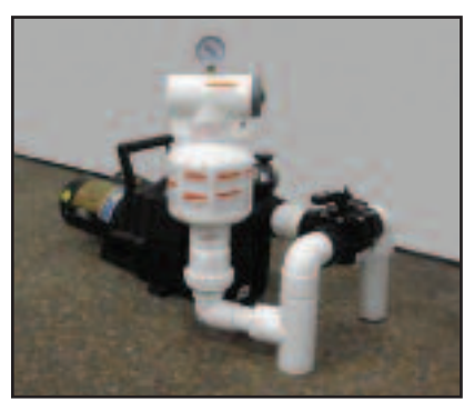
The SVRS is mounted in the main drain suction line, close to the circulation pump.