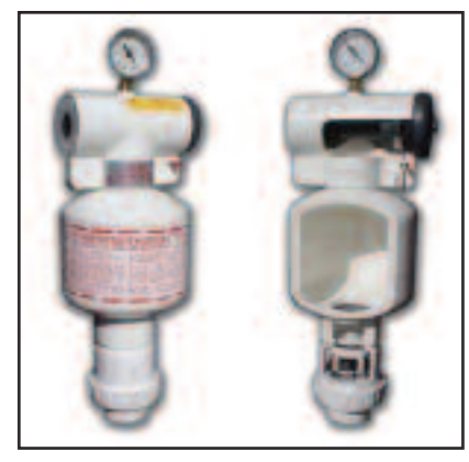
Vac-AlertTM Model VA-2000 SVRS, with cutaway showing the interior.